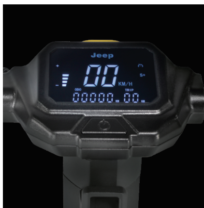
3.5" LED display