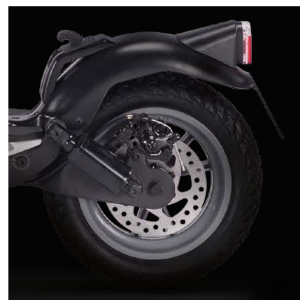
Rear disc brake