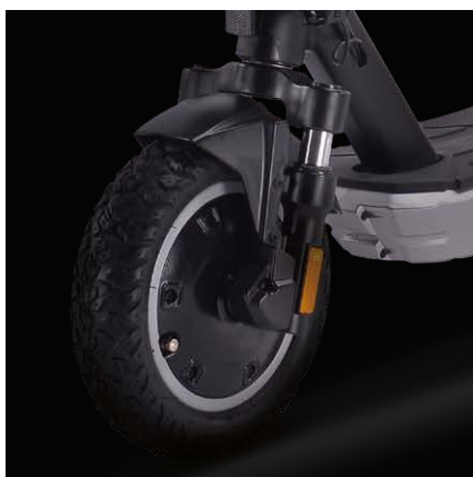
10" Off-Road tubeless tyres